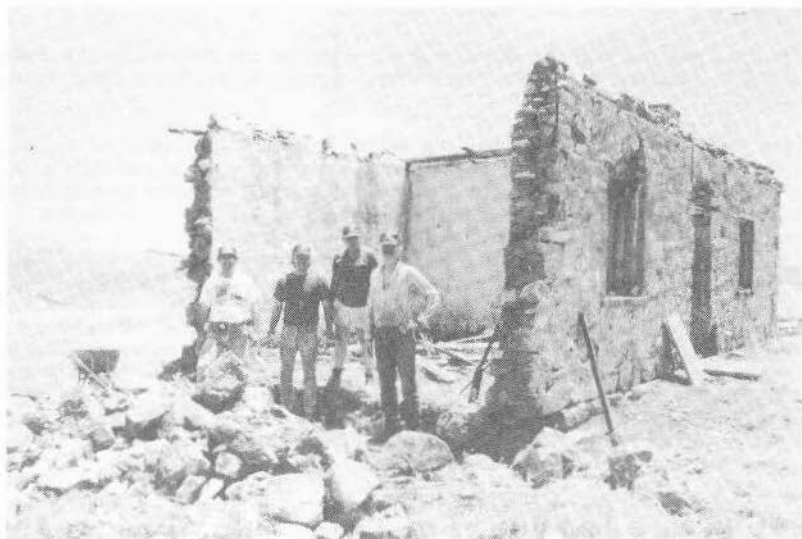
HISKEY'S HUT BEFORE RESTORATION

* Bonython, C.W., Walking the Flinders Ranges . Rigby, Adelaide, 1971 (out of print)